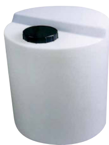
Polyethylene tanks SER Series